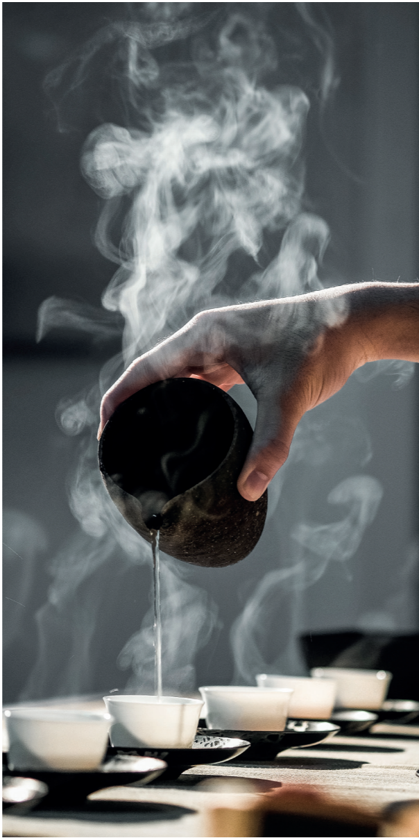
The Ultimate Wellness Experience

Choose to delight yourself in one of the short-timed rituals that promise to satisfy your senses and indulge your skin, while allowing you to meet your busy schedule. Instantly revitalize and obtain a luminous touch, reveal a healthy-glowing look, set yourself free from any kind of tension, ward off a stressful day or entice everyone with the most sparkling and radiant look.